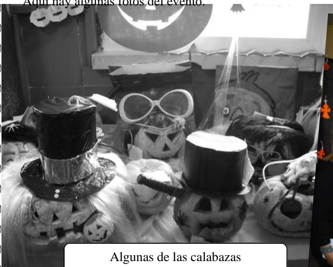
Algunas de las calabazas

Esperamos que el curso que viene haya otro concurso y que la participación sea así de alta. Aquí hay algunas fotos del evento.