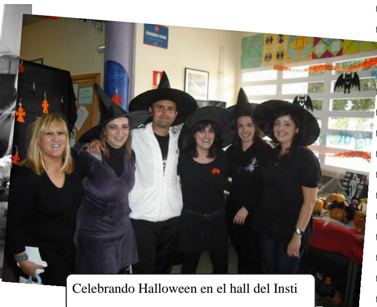
Celebrando Halloween en el hall del Insti