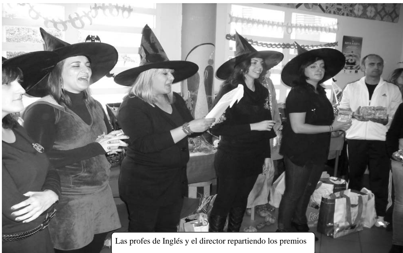
Las profes de Inglés y el director repartiendo los premios

Finally, we hope we'll have another contest next year and our students will participate as they have done this year. Here they are some photographs of Halloween and its pumpkins.