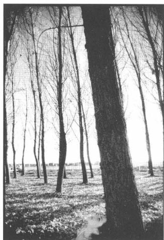
5. Paula Montávez